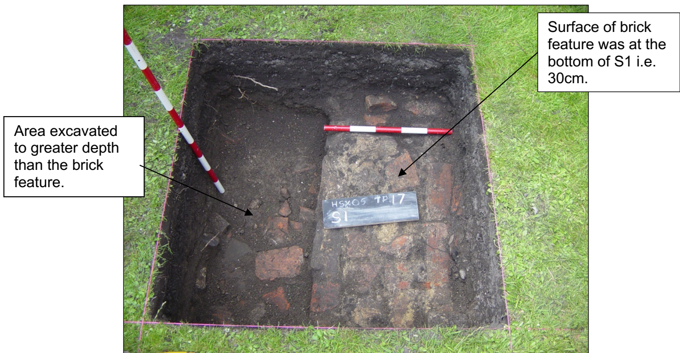
Fig 2: Brick feature in TP 17.

This feature consisted of two parallel rows of bricks with an infill of brick rubble, giving a total width of 40-50cm and ran east / west, from the house towards the stream. The feature was one course deep and heavily mortared.