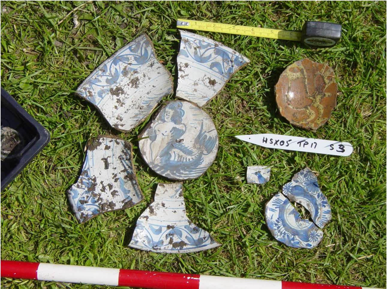
Fig 6: 16 th and 17 th century pottery from Spit 3.