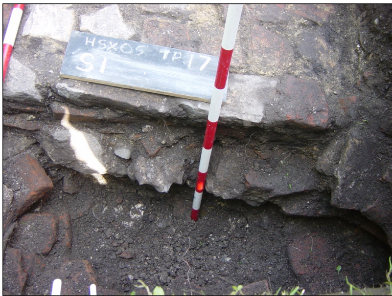
Fig 3: Brick feature laid on top of brick/tile demolition layer.

The pottery from Test Pit 17 is particularly interesting.